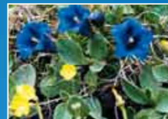
Mountain Flower Trail