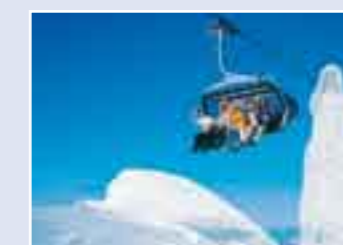
Ice Flyer Chairlift