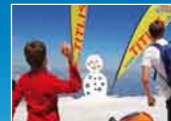
Fun on Snow