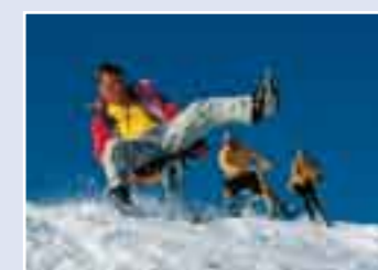
Glacier Park Snow Toys