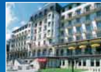
Hotel Terrace in Engelberg